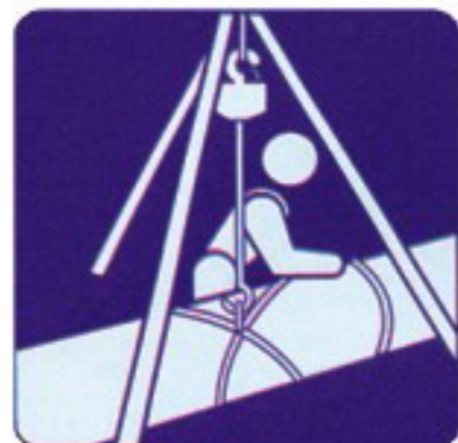
Laying conduits and pipelines