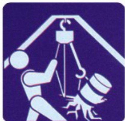
Installing under-water pump