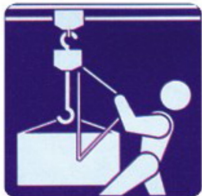
Moving products from one place to another